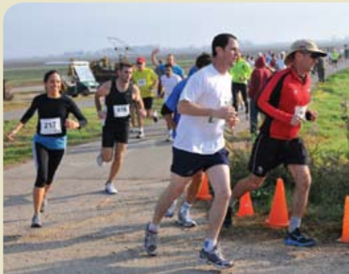
The Commanding General of the Northern Command, Maj. Gen. Yair Golan (in red) took third place of the officers.