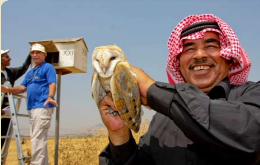
A Jordanian farmer holds a Barn Owl in Kibbutz Sde Eliyaho, Israel, in a joint seminar with Palestinians, Jordanians and Israelis.