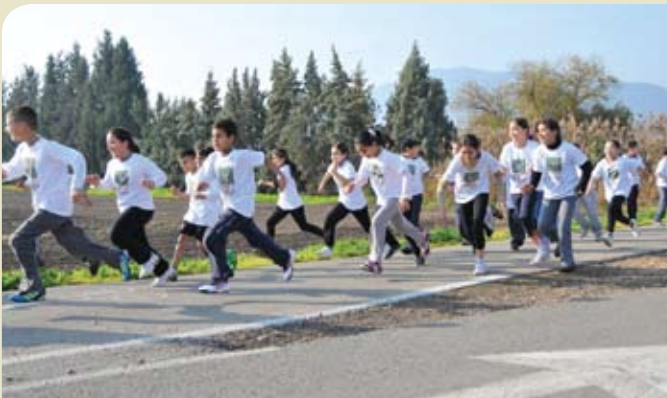
“Graceful Prinia Run” – 560 pupils from the “Yes to the Bird” project running 1 km.