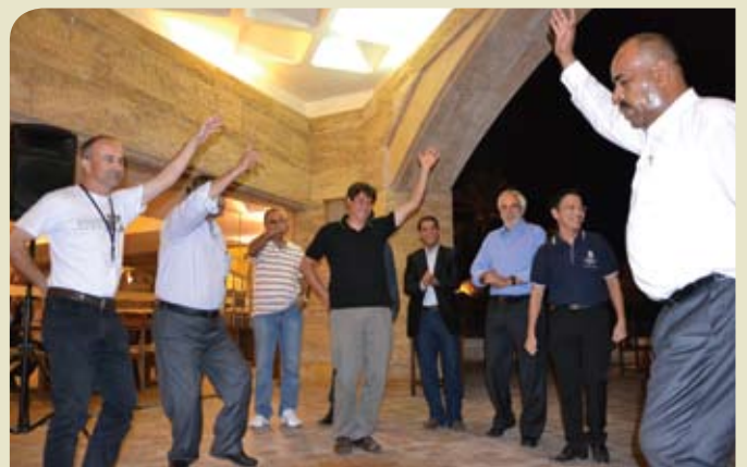
The Seminar in the Dead Sea Jordan with 70 farmers, decision makers and conservators was ended with joint dances of Palestinians, Jordanians and Israelis.