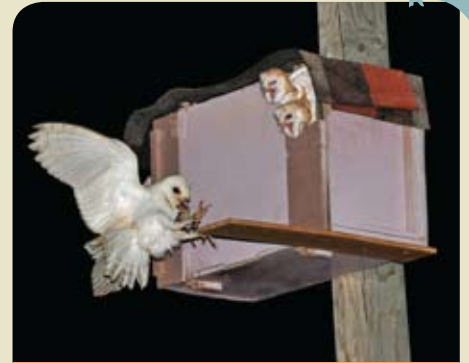
Barn Owl nesting in an ammunition box converted to a nesting box. A modern version of prophet Jesiah: "...and they shall beat their swords into plowshares, and their spears into pruning hooks." (Jesiah 2:4).

In our troubled middle east, where hatred and suspiciousness are still the rule, where many peace makers had failed, the Barn Owl did the job. Once again it was proved that nature conservation and cooperation between farmers and environmentalist can become a solid bridge for peace and coexistence. In the last 3 years, two parallel projects that were funded by the European Commission, and managed by the Hanns Seidel Foundation from Germany and the Israeli Peres institute for peace, gathered 3 partners from Israel Palestine and Jordan and create a network of farmers and environmentalists that do Biological pest control through Barn Owls and Kestrels. The Society for the Protection of Nature in Israel, Tel Aviv University, The Wildlife society of Palestine and Amman Center for Peace and Development conducted national level projects to endow the practice of nest boxes for Barn Owls and Kestrels that replaced the usage of hazardous poisons for rodents. In addition to that a row of cross border activities and exchange visits took place and created