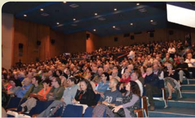
The hall at Kfar Blum was completely full (640 people) during the Paul Winter concert