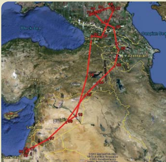
Reverse migration course of a female long legged buzzard Bat-Sheva (1672) from Israel to Russia. Bat-Sheva started to migrate north on 21.6.11 and came back to Israel on 29.11.11: All the birds are named after biblical named of King David wives' as he was active in this area.

Our research deals with the establishment of a new inter-specific competition between two raptor species in the Judean Foothills, caused by man-made land cover changes. These changes have not only influenced an entire long-legged buzzards' ( Buteo rufinus ) population, that abandoned their historical habitat in the Judean Mountains, but have also directly influenced a local short-toed eagles' ( Circus gallicus ) population as well, due to a transfer of a new and competitive species ( buzzard ) to its traditional nesting area. Thus, this research has important scientific and ecological implications. It will assist to preserve raptors species and open habitats as well.