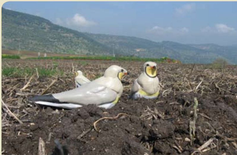
The “Hoopoe Foundation” financed the urgent project to save the Collared Pratincoles in the Hula Valley. Sculptures of Collared Pratincoles were placed in ploughed fields in the Hula Nature Reserve, accompanied by recorded Pratincoles calls in order to attract the birds to nest in the protected area, so that their nests would not be destroyed in the agricultural areas. Design & painting of sculptures: Zev Labinger

We are proud to summarize the 14 initial projects supported by the foundation in conjunction with government, academic and public bodies, as well as other foundations. The projects dealt with the educational aspects of the “Yes to the Bird” initiative – about 4,000 4 th grade pupils (half from the Arab sector), from 98 schools