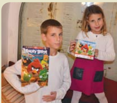
Children enthusiastically collecting the albums! Of Angry Birds adopting the “real birds”