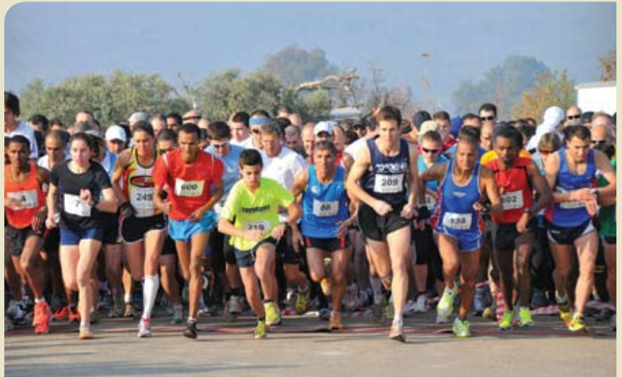
600 soldiers & officers with 600 people of the general public starting the “Crane Run”.