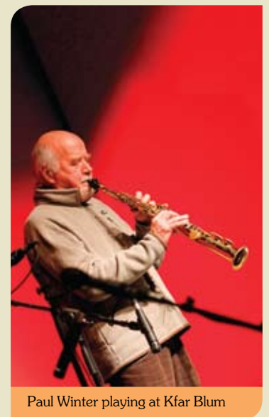
Paul Winter playing at Kfar Blum