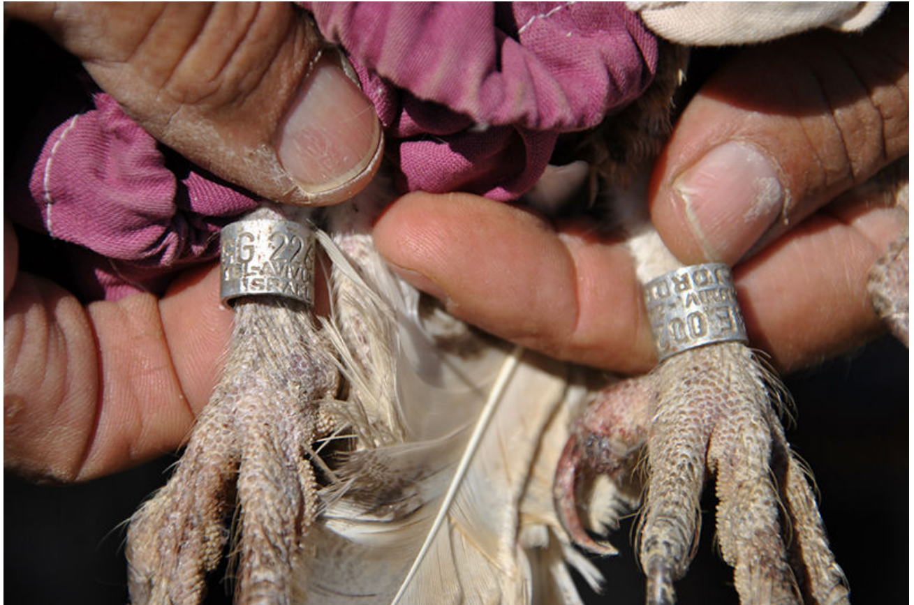
A barn owl reared in Israel (identifying ring on left) has formed a breeding pair with a barn owl reared in Jordan (shown by the ring on the right).