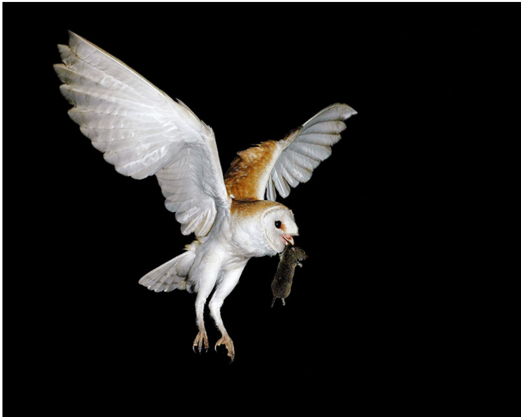
A barn owl with a captured vole.