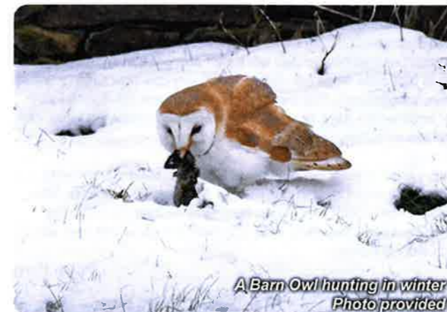
A Barn Owl hunting in winter Photo provided

Then late one afternoon I saw the familiar flash of white fly past the cottage and I saw a Barn Owl land in my field. I managed to get my camera out just in time to photograph it eating the vole.