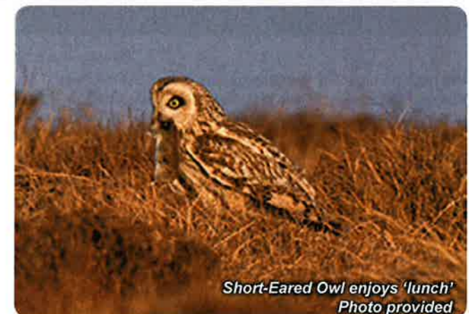
Short-Eared Owl enjoys 'lunch'

I thought I would share the photos with you all. I use a Nikon D500 with 200-500 lens for my bird photography.